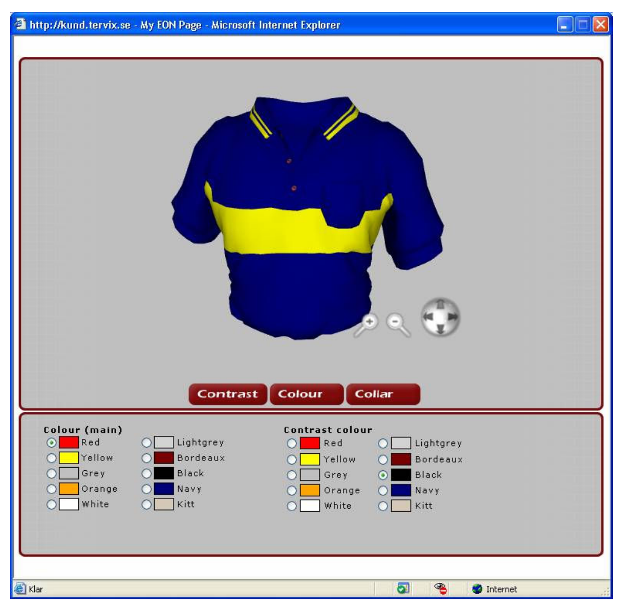
Fig. 3: A screen dump of the web page with the VR application

The prototype of the VR module was evaluated by different people at EON and general opinion was very positive. However, so far (February 2005) EON has not received any orders which is why no commercial VR application has been developed by Tervix. Another reason is that EON's customers are engineers and designers in large companies e.g. within the automotive industry and they have very little interest in spreading the work they have done outside their profession. EON in turn has enough to do to sell their VR products to the engineers and designers which is why no priority is given to the sale of additional products to other market segments. Also larger companies have their own content management systems and rules/organisations for web publishing that are difficult to change.